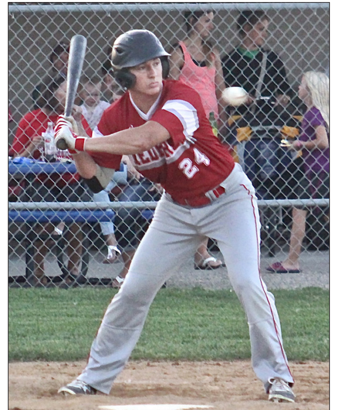
0721 redbirds 8

Coming this week in the Rock County Star Herald