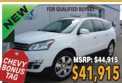
2017 CHEVROLET TRAVERSE PREMIER, HEATED SEATS #17108