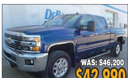
2015 CHEVROLET SILVERADO 3500HD LTZ, Z71, HTD & CL LTR, 44K #1778A