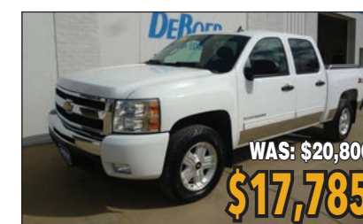
2011 CHEVROLET SILVERADO 1500 LT, Z71, ALL STAR PKG, 162K #1689C