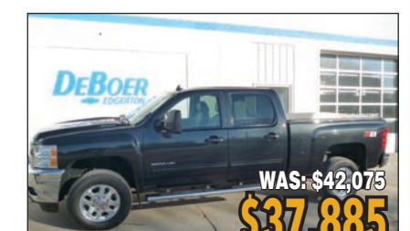
2012 CHEVROLET SILVERADO 3500HD LTZ, DURAMAX-ALLISON, 67K #1760A