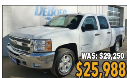
2013 CHEVROLET SILVERADO 1500 LT, Z71, ALL STAR, 55K #1709D