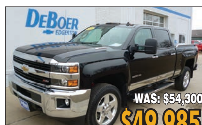
2015 CHEVROLET SILVERADO 2500HD LTZ, Z71, DURAMAX, 34K #1779A