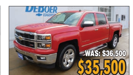
2014 CHEVROLET SILVERADO 1500 LTZ, Z71, 39K #1780B