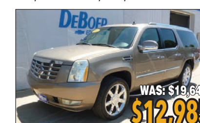
2007 CADILLAC ESCALADE ESV, DVD SURROUND, 146K #1618B