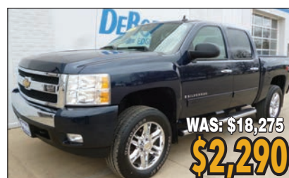
2007 CHEVROLET SILVERADO 1500 LT W-1LT, LEATHER, 149K #1746B