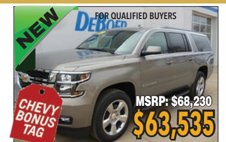
2017 CHEVROLET SUBURBAN LT, LUXURY PKG #17116