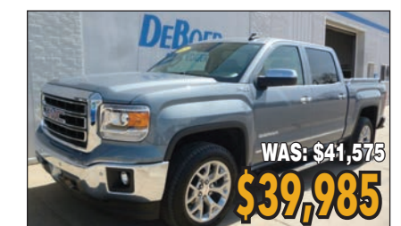
2015 GMC SIERRA 1500 Z71, SLT PREFERRED PKG, 25K #1784A