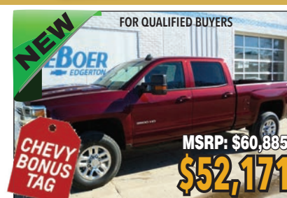
2017 CHEVROLET SILVERADO 3500HD LT, HEATED LEATHER #1792