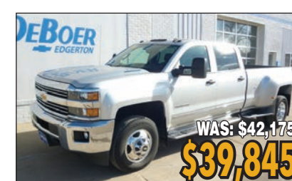
2015 CHEVROLET SILVERADO 3500HD LT, DURAMAX, LEATHER, 89K #1771A