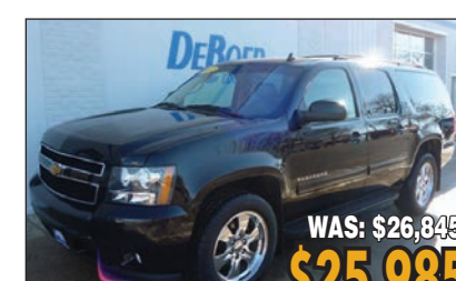
2012 CHEVROLET SUBURBAN LT, LUXURY PKG, DVD, 117K #1712B