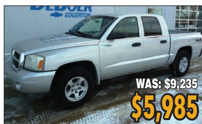
2005 DODGE DAKOTA SLT, QUAD CAB, 186K #A1611B