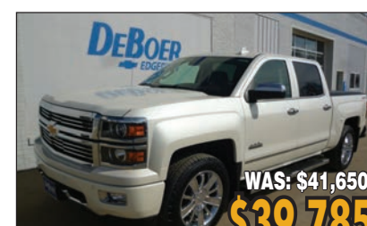
2015 CHEVROLET SILVERADO 1500 HIGH COUNTRY, 37K #1781A