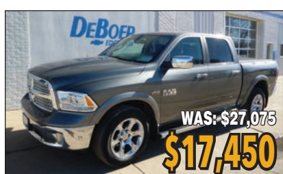
2013 RAM 1500 LARAMIE, CHROME PKG, 176K #A1643B