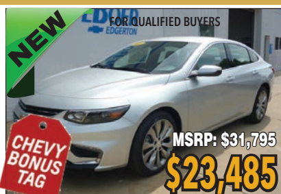
2016 CHEVROLET MALIBU PREMIER, NAV, BOSE #16143