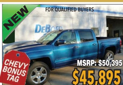
2017 CHEVROLET SILVERADO 1500 LT, Z71, ALL STAR #1739