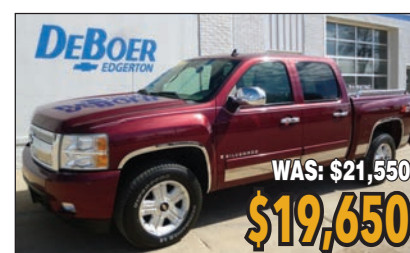
2008 CHEVROLET SILVERADO 1500 LTZ, 121K #1788A