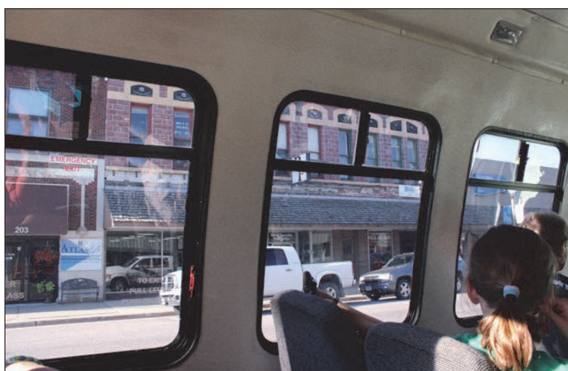
The large windows of the city of Luverne trolley allow tour participants to easily view the buildings on Luverne's Main Street.

Regular open house hours for the Hinkly House are Tuesdays, Thursdays and Saturdays from 2 to 4 p.m. from June through August.