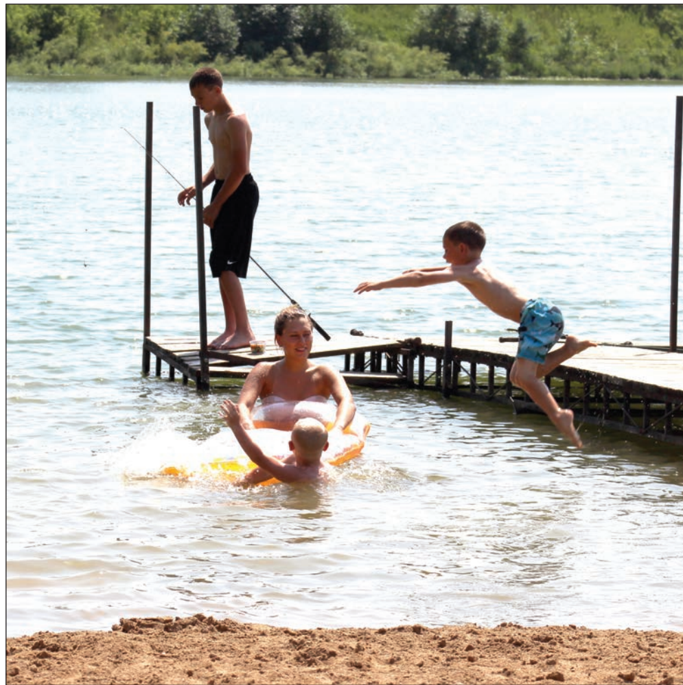
'The Lake' is fully stocked with fish, fun

Law enforcement authorities are currently handling the case.