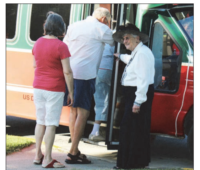
Mavis Fodness Photos/0623 Hinkly Tour