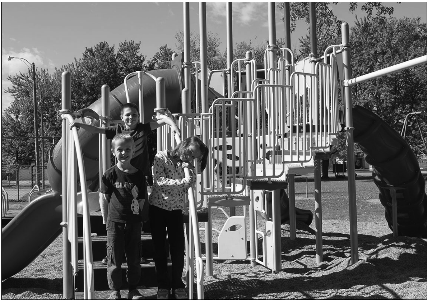
1022 playground equipment