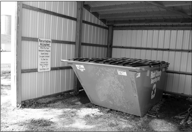
Millennium Recycling

RCO cited safety hazards and changes in the recycling industry as reasons for no longer providing workers.