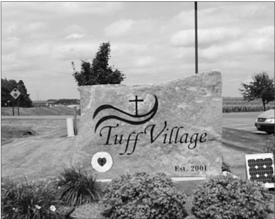
Tuff Village