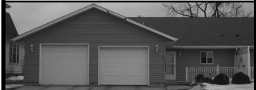
207 S CHURCH, HILLS

You will find Charm and Character throughout this 2 story home located on a larger corner lot. The spacious front entry has wood floors which lead to the living room or the open stairway leading to the 2nd level. Main level features a form dining room, kitchen with pantry and a large entryway to the back yard. Upper level hosts 4 bedrooms and an updated bath. The lower level is additional space waiting to be finished. Enjoy the covered front porch or move the gathering to the large privately fenced in backyard. Recent upgrades include a furnace, shingles and some windows.