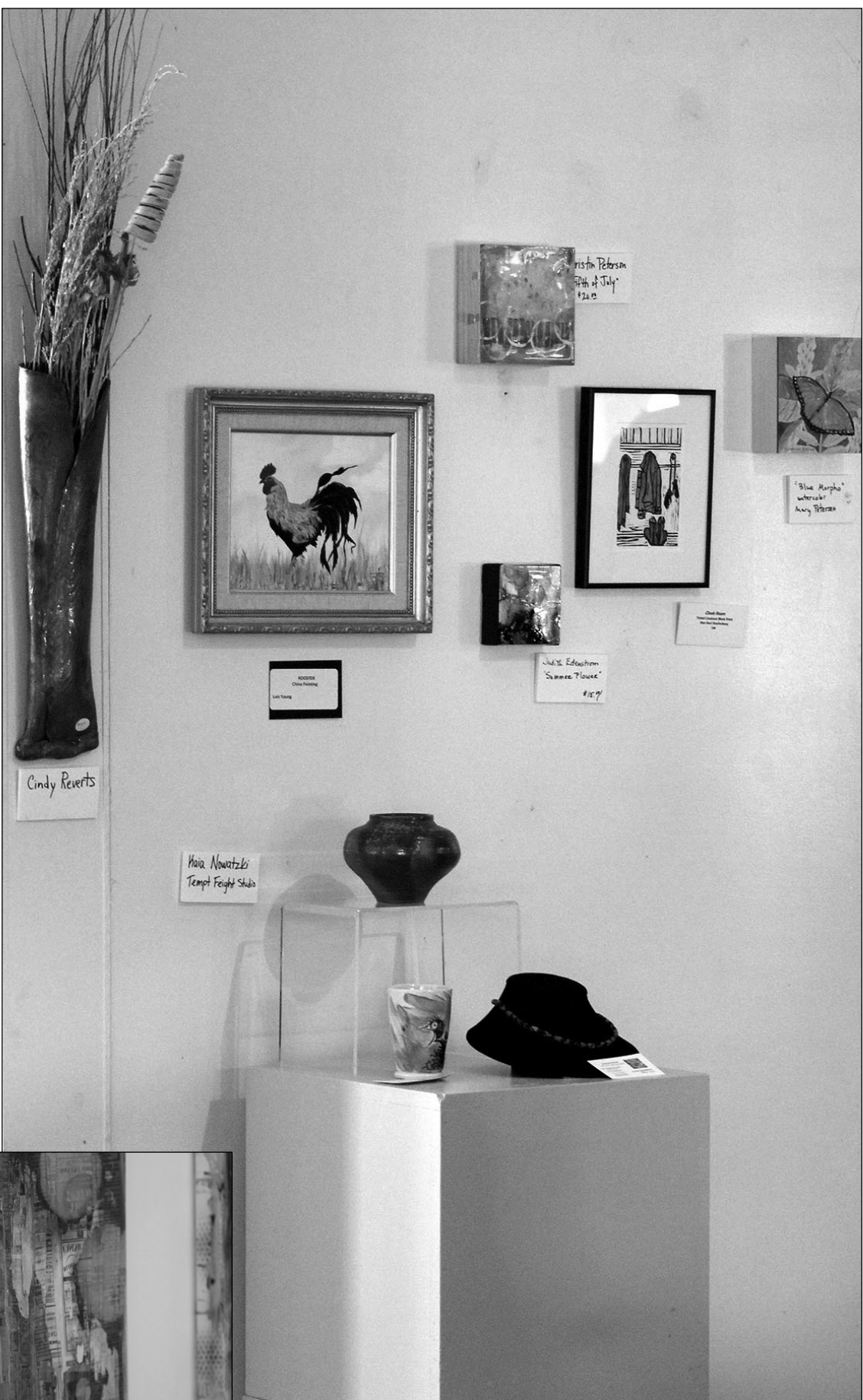
The center wall near the Carnegie entrance features a sample of each of the 11 female artists participating in the August display.