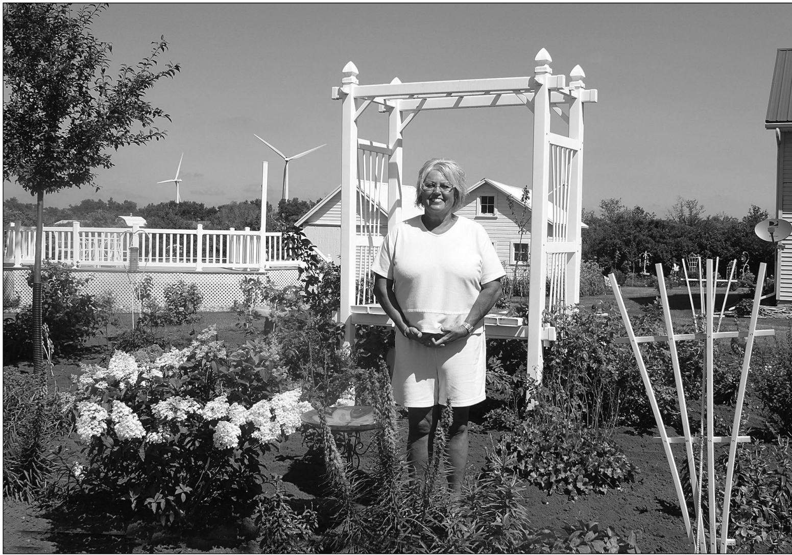
Glenda McGaffee photos/0820 Schwartzflowers

"Gardening keeps a person very busy. You are