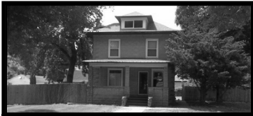
300 JOSEPHINE, HILLS

Call Chantel to advertise today 283-2333