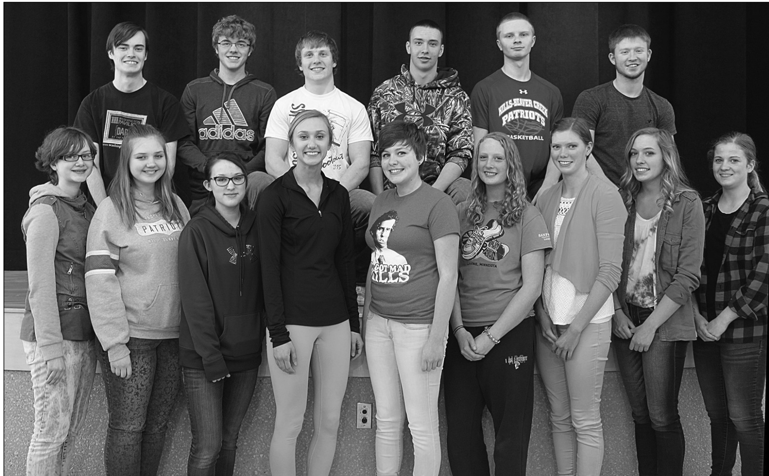
H-BC band students

•noted that Monday, May 9, is the next regular school board meeting, Friday, May 27, at 7 p.m. is H-BC graduation, and Tuesday, May 23, is the second regular school board meeting in May.