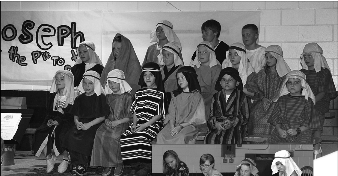
Hills Christian School students