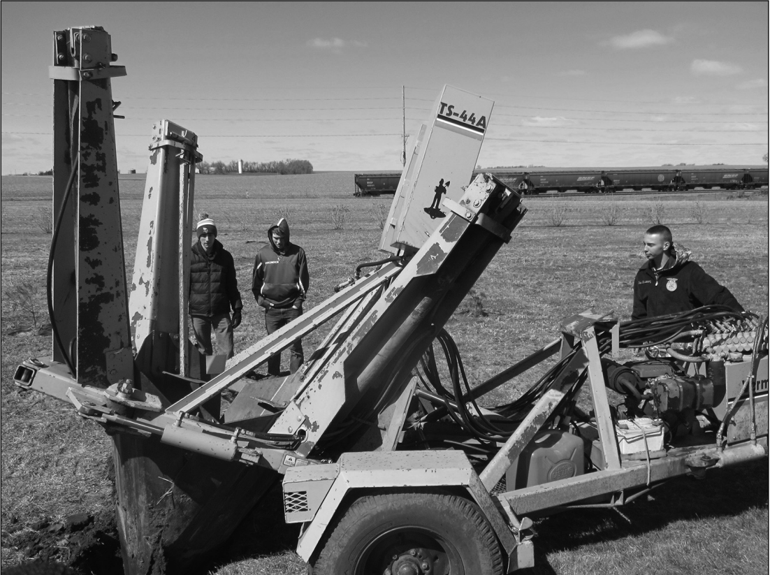
Dustin Teune (from left), Dawson Leenderts, and Dustin Fuerstenberg fill in an existing hole with soil.

World's Best Sugar Cookies 1 cup powdered sugar 1 cup granulated sugar 1 cup margarine or butter 1 cup oil 2 beaten eggs 2 teaspoons vanilla 4-5 cups flour 1 teaspoon baking soda 1 teaspoon cream of tartar 1/4 teaspoon salt Cream the powdered sugar, granulated sugar and margarine or butter. Add the oil, then the eggs, vanilla, flour, soda, cream of tartar, and salt. Mix well. Roll into small balls, roll in sugar, and press flat with a glass dipped in sugar. Bake at 350 degrees for 10-12 minutes.